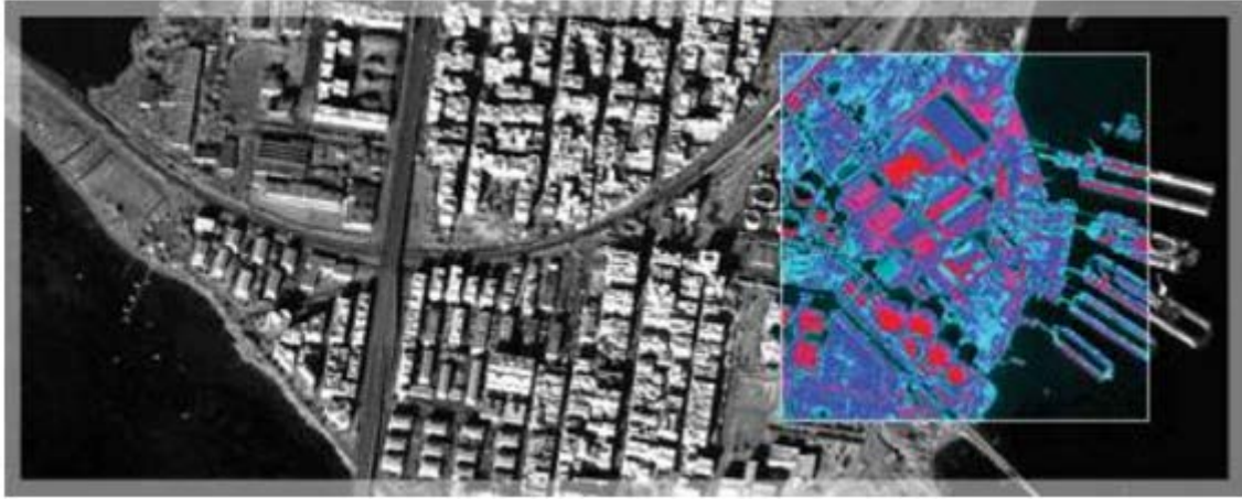
Fig. 3 Remote sensing image of some area in Mongolia from Spot 5

The analysis of Figure 3 shows that the accuracy of image classification increases with the increase of evolutionary algebra, with a larger increase between the twentieth and the fortieth generations, and a more stable growth between the fortieth and the 100th generations, and maintains a relatively high stationary state after the increase of the classification accuracy of the 180th generation to 92.7%. It can be seen that with the continuous evolution, the adaptive function can be gradually close to the ideal value, but the largest evolutionary algebra in this study is 300, the maximum can only evolve to the highest precision of 92.89% after the 260th generation, and the accuracy of the image classification is high, which can meet the requirements.